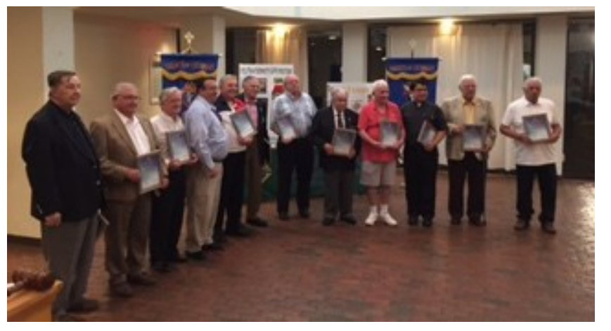
A group of our Council's Honorary Life members